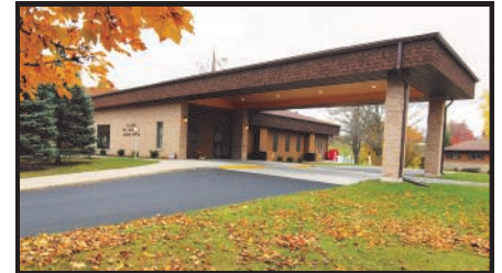
ST. JOHN THE EVANGELIST - Gillett

Mass Times: Saturday, 4:00 PM Sunday, 10:15 AM Tuesday, 8:30 AM